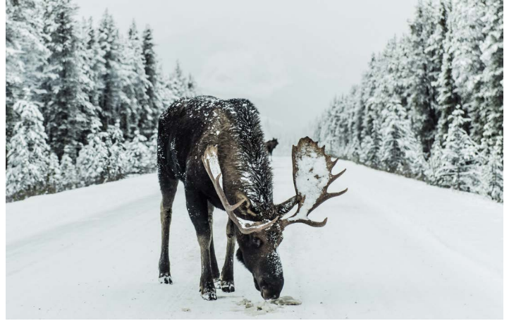
Enjoy the Canadian Rockies and wildlife

Lethbridge has a population of over 100,000 residents that is large enough to provide all the major advantages of a big city , yet small enough to ensure safe and friendly surroundings , easy access to services, and a close sense of community .