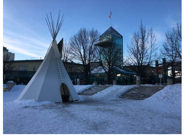
Enjoy a multi-cultural city in the heart of Canada

Located in the heart of Canada, Manitoba is a province full of beautiful and diverse landscapes.